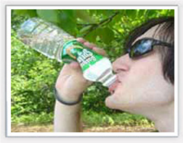
CHL Series Pump