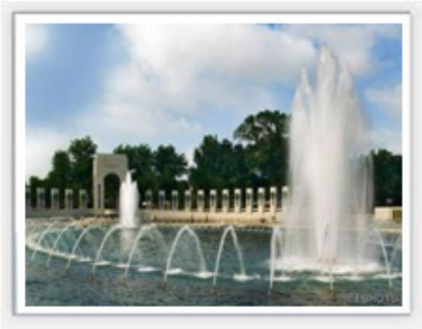
SJ Series Pump