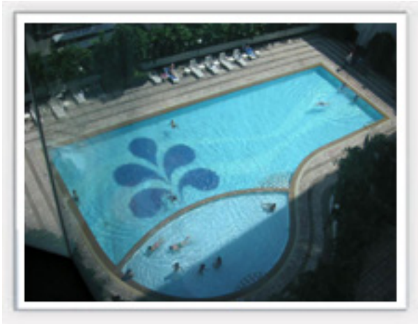
CHL Series Pump